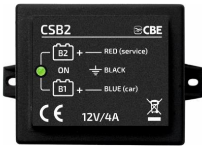
CSB2 p/n 205025 / GR5025