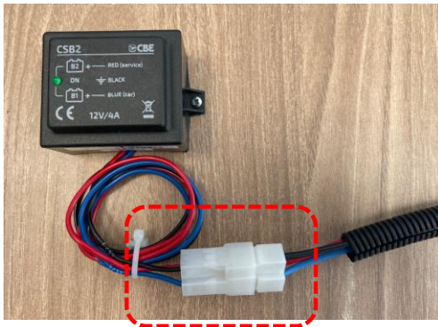
CSB2 p/n 205025 / GR5025